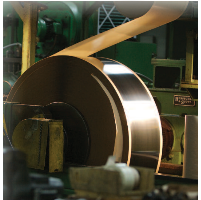
A roller in action at Ulbrich

There is a significant body of literature in the public domain which relates that niobium was first identified as a unique mineral in 1734 by John Winthrop the first governor of the colony of Connecticut. He named the mineral columbite and sent a sample to the British Museum in London, England, but it wasn't studied further until English chemist Charles Hatchett conducted tests on it in 1801. Hatchett determined that it was a new element, with properties similar to tantalum, and he named it columbium. However, after further studies, another English Chemist, William Hyde Wollaston averred that tantalum and columbium were identical, a determination that was refuted by a German chemist, Heinrich Rose, who reported in 1846 that tantalum ores