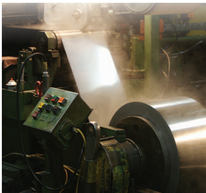
Cold rolling of sheets at Ulbrich.

[1] http://education.jlab.org/sitetour/guidedtourt05.html