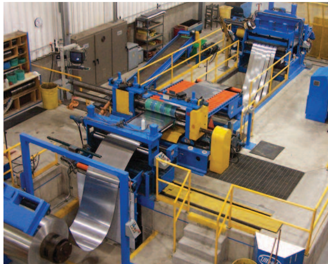
Slitting sheets into fine strips.

Ulbrich Stainless Steels & Special Metals, Inc., produces