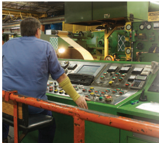
Cold rolling operators controls.

applications for titanium foils from Ulbrich include the production of hydrogen in hydrolyzers from water; foils for the production of structural honeycomb used in aero structures; and foils for the production of composite materials used in aero structures.